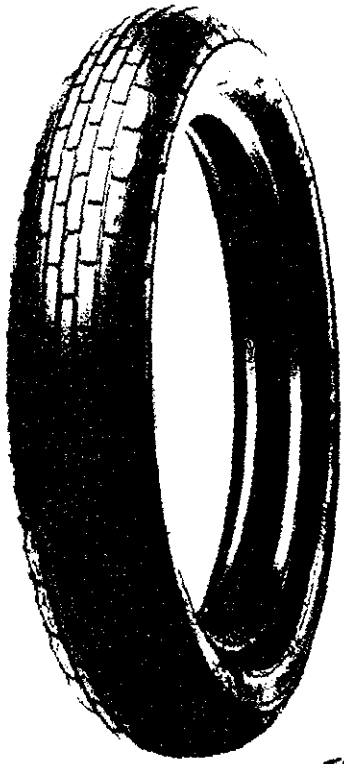
Super Twin RC TK 22