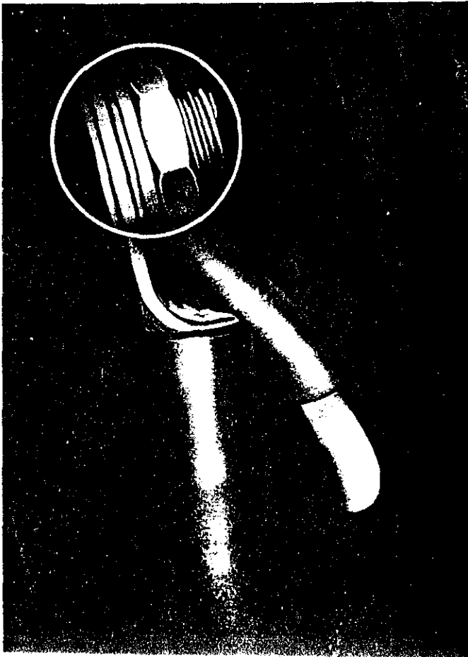
Illustration No. 2

Possible short created by the wrong assembly of both cables. (See arrow.)